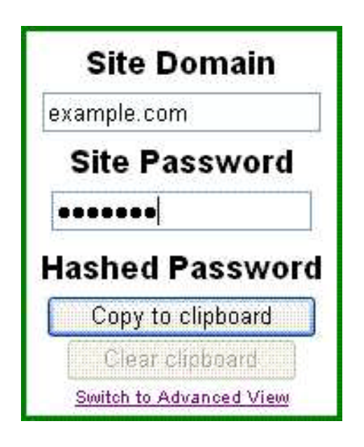
Figure 6: Remote hashing

if PwdHash becomes popular enough to be installed in most common browsers, there would be no need to use this remote hashing facility.