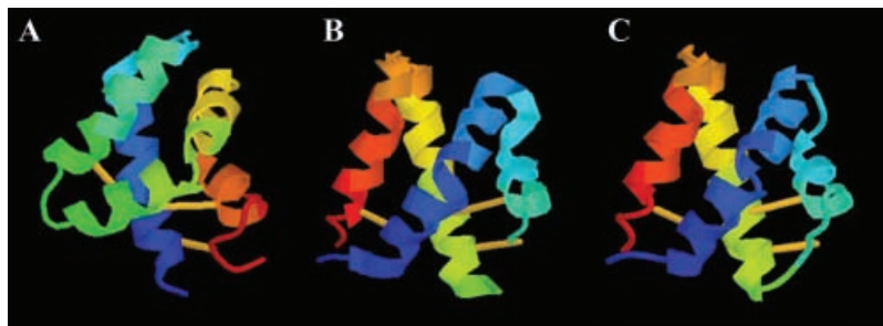
Fig. 3. The 'saposin fold'. (A) Ribbon representation of the structure of NK-lysin, a saposin-like protein [26]. The N-terminal domain is shown in blue and C-terminal domain in red. (B) Ribbon representation of the structure of the PSI domain of barley prophytepsin [25] (N-terminal domain, blue; C-terminal domain, red). (C) Model structure of the PSI domain of cardosin A based on the crystal structure of prophytepsin PSI (N-terminal domain, blue; C-terminal domain, red). Prepared with the program PROTEIN EXPLORER http://www.proteinexplorer.org .

Plant APs are widely distributed in the plant kingdom and have been detected or purified from monocotyledonous and dicotyledonous species as well as gymnosperms. Recently, the cDNA of an AP was cloned from Chlamydomonas