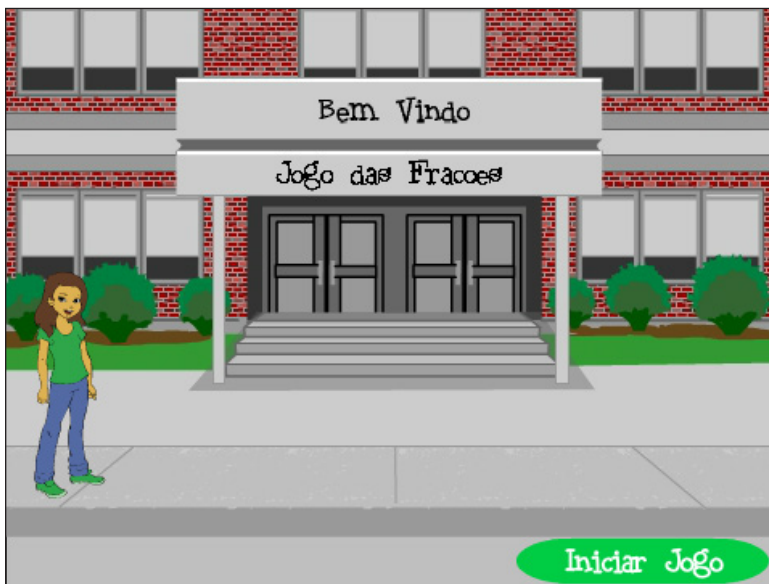
Figure 1 – Home screen of the game