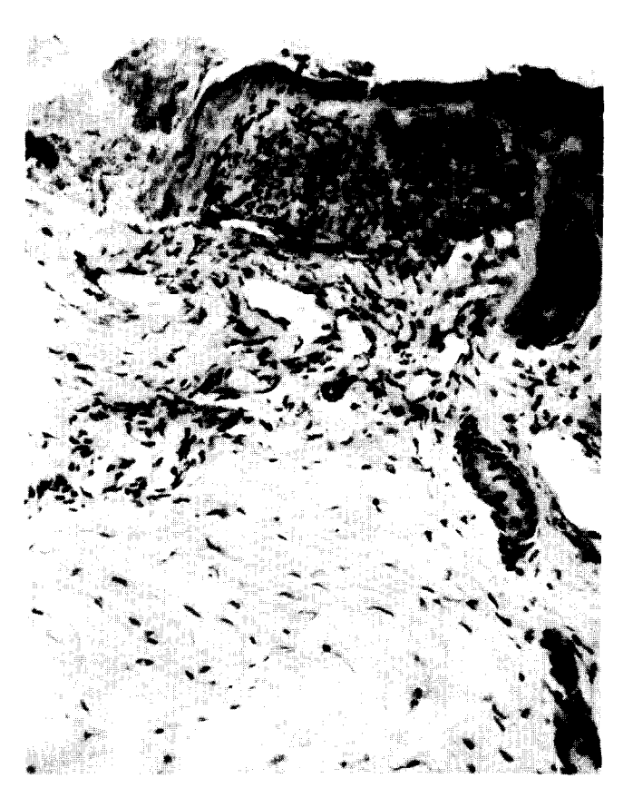
Fig. 2 Biopsy of TEA CO<sub>2</sub> lesion showing superficial crusting, flattened epidermis, sharply circumscribed polymorphonuclear and lymphocytic infiltrate. Hematoxylin-eosin X200

In these experiments on the skin, the TEA laser had a helical electrode structure, operating in the lowest order of transverse gaussian mode. There were, also, several