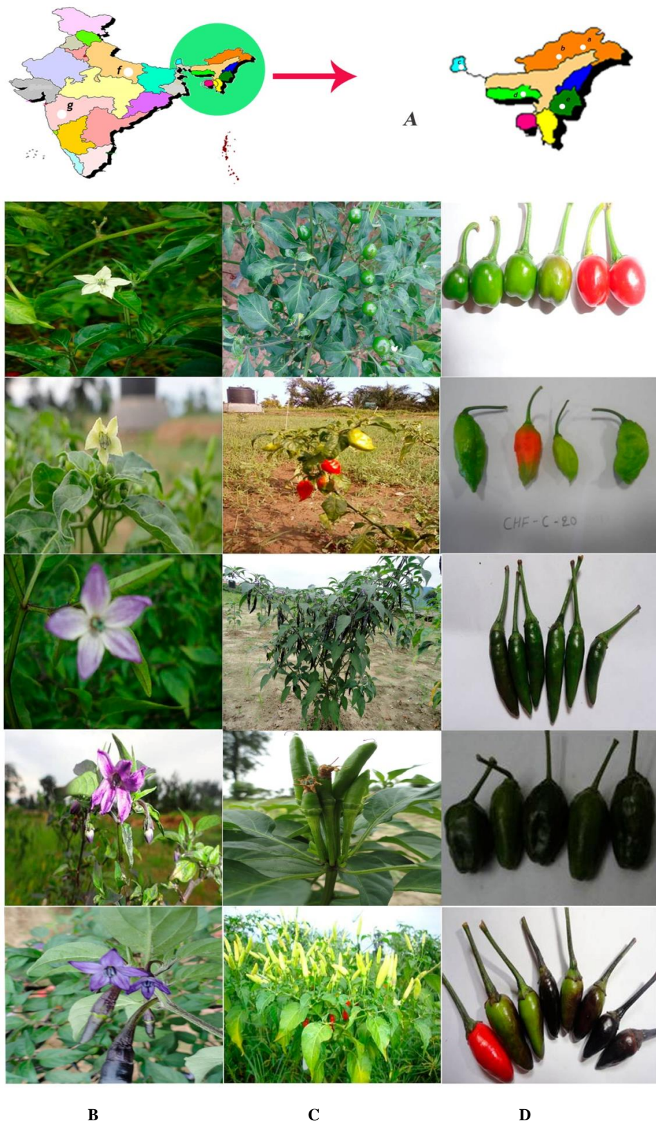
Fig 1. (A) India map showing geographical distribution of the chilli genotypes which was collected from Arunachal Pradesh (a and b), Sikkim (c), Meghalaya (d), Manipur (e), Uttar Pradesh (f) and Maharashtra (g). (B) A representative picture showing variation in corolla colour, (C) fruiting behavior and (D) fruit shape and colour.

of reference chilli genotypes (CHFC11 - 20), sharing many protein bands. The members of sub cluster Ia (Table 3) which were from East Siang, Arunachal Pradesh having highest