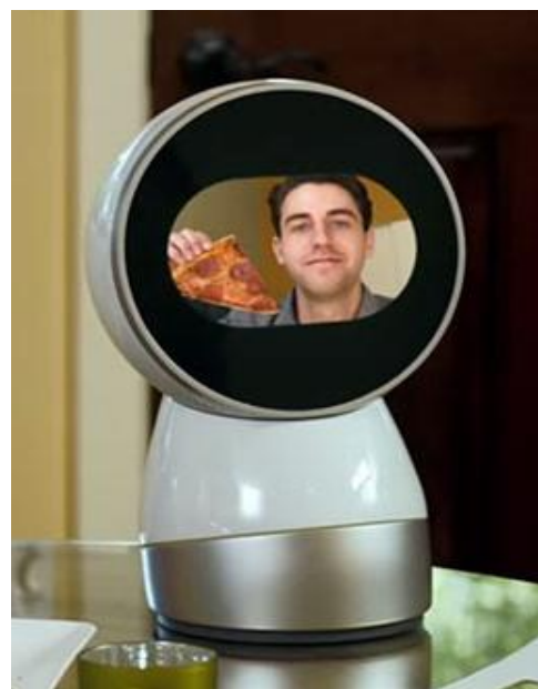
Fig 2. JIBO's Avatar Mode

JIBO's camera can also be used for video conferencing. Using the JIBO app, people can connect to a JIBO. Once connected, user on the Non-JIBO side has to use the JIBO app. The app will then use the front camera of the smart phone tablet to show app user's to people on the JIBO side. On the JIBO, people can see the person's face on JIBO's screen. This feature is named by the makers as the 'avatar feature'. By default JIBO will show the face of the person speaking near it. To track the speaker efficiently JIBO uses its 3-axis mechanism. JIBO can move 360 degrees and hence show the speaker efficiently. The user on the non JIBO side can choose the track speaker option or can track only a specific person.