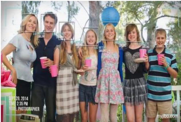
Fig 3. JIBO's Photographer Mode