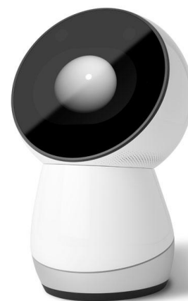
Fig 1. Structure Of JIBO

JIBO is designed to be constantly plugged in. It will always need a power-source like a personal desktop. Batteries will be separately available and its battery life is 30 minutes. Its processor is based on ARM and its platform is Linux based. Developers in the future can make JavaScript-centric apps for the JIBO store. Consumers can purchase apps from the JIBO Store.