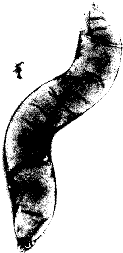
Figure 2. Negative stain of magnetic spirillum strain 1. This bacterium was magnified 50,000 times with a transmission electron microscope. Bar = 1 micrometer

presence of intracellular magnetite implies a process of bacterial synthesis.