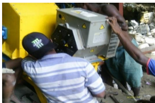
Figure 5. Plan Form Generator

As for the technical specifications of the PLTMH Generator Sasnek is: 1-phase AC Synchronous Generator 220 V, 50 Hz 1500 rpm, the power factor of 1 x 10 kW, generator capacity of 10 kW. The planned form of the generator shown in Figure 5.