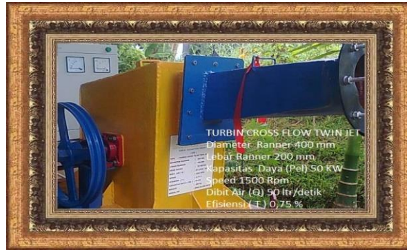
Figure 4. Turbines in use for PLTMH Sasnek