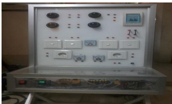
Figure 3. Control circuit

For the control circuit will be installed separately on a module using mica, the control circuit, shown in Figure 3, consists of the components of the electrical panel.