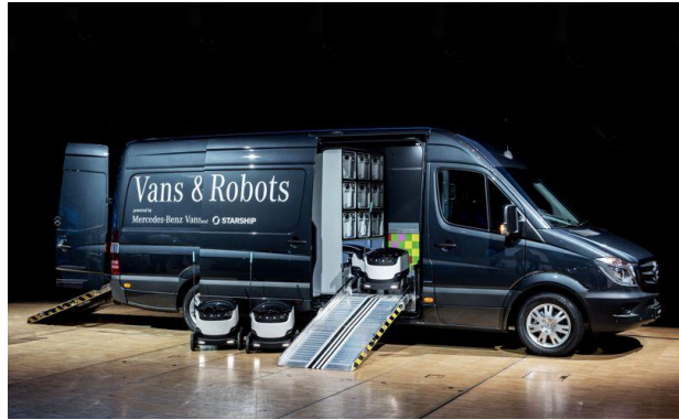
3 FIGURE 1 A Mercedes Benz Van Outfitted for Use with Starship Technologies' SADR 4 5 6 7