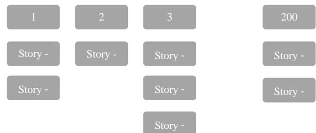
Figure 4: Bucket System

Larger number of items and a larger number of team estimation is complex by using Planning Poker. Bucket System used for a larger number of items to be estimated by a larger number of teams. Various relative size buckets are created and assigned the numbers for each bucket from 0,1,2,3,4,5,8,13,20,30,50,100, 200. The estimator picks up the task/story from the backlog and place the Story into anyone the suitable bucket defined above. Proper explanation provides by the estimator of how that suites in that bucket. Use the divide-and-conquer technique to go the rest of the backlog items and assign a proper estimation bucket for each task/story. The activity repeated until the task/stories completed in the backlog. The Scrum Master roles it to check that nobody moves the task/story unless sanity checks are done. Bucket System is one of the collaborative estimation techniques and fast. Requires an experienced team to estimate the product backlogs into appropriate buckets.