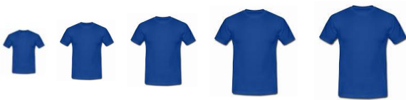
Figure 2: T-Shirt Size

T-shirt model uses the sizes of XS (Extra Small), S (Small), M (Medium), L (Large), XL (Extra Large). The same way in Agile estimation uses T-shirt sizes for doing rough estimates for the backlog of items is vast. The model helps to do rough estimations very quickly for project scope. Decide a relative size (mostly Medium) after mutual discussion in the teams and arrive at one collective agreement by the team members for estimations—the agreed values assigned to the requirement according to the relative size assigned to Medium size. The primary advantage of t-shirt sizes is to estimate quickly and start the project and become familiar with relative estimating in the team—range type estimation rather than an absolute number. Rough estimations can be agreed upon by the team quickly.