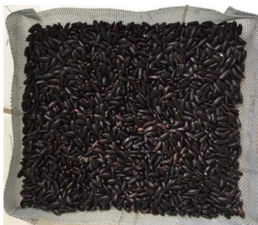
Figure 1. Black rice grains

Black rice grains were dried in triplicate in a forced air circulation oven regulated to operate at temperatures of 40, 50, 60, 70 and 80 °C, with air speed of 1.5 m/s. Samples were uniformly distributed on steel screen trays, forming a thin layer (Figure 1).