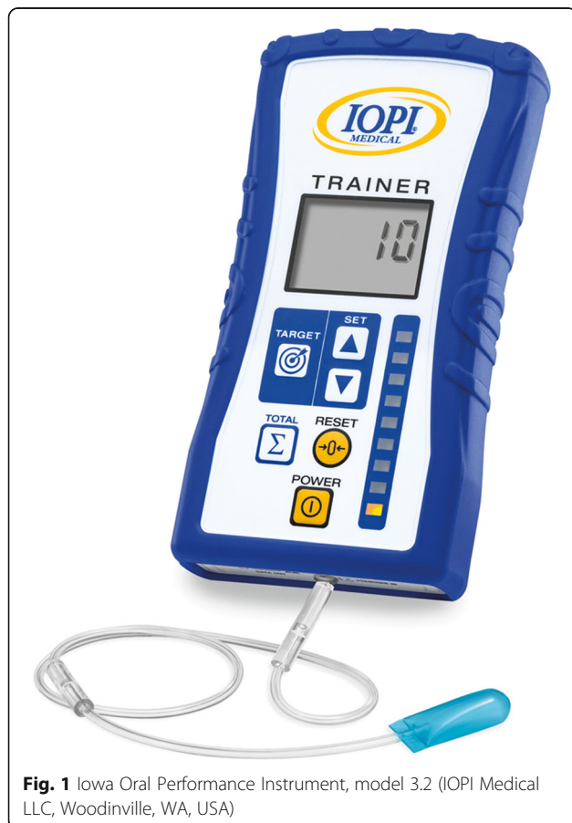
Fig. 1 Iowa Oral Performance Instrument, model 3.2 (IOPI Medical LLC, Woodinville, WA, USA)

Maximal chin-tuck strength (in Newtons, N) is measured by means of a dynamometer (Microfet™, Biometrics, Almere, The Netherlands) (Fig. 2). Patients are asked to place their chin on the chin bar and keep their mouth and teeth closed. A fixed belt stabilizes the patients' head. They are instructed to press their chin down