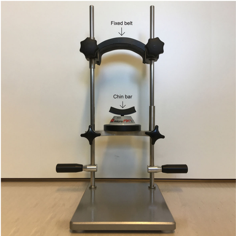
Fig. 2 Examination frame and dynamometer (Microfet™, Biometrics, Almere, The Netherlands)