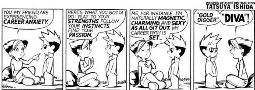
Figure 1.1 Sinfest (I). Source: Sinfest: Viva La Resistance ™ © 2012 Tatsuya Ishida.

If you want to analyze comics critically, it makes sense to consider how the clues on the page and the inferences they suggest tie in with how you make sense of the comic. The cognitive processes involved in reading comics are usually pre-conscious, that is, you would not be aware of them when you are actually reading a comic, but they contribute fundamentally to your meaning-making.