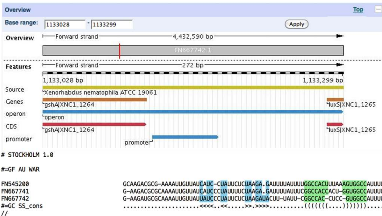
Figure 7. Xenorhabdus MicA homologs found using Plan A. The top panel shows the location of a putative micA homolog with a marginal Infernal E -value in X. nematophila , sharing synteny with established micA sequences in E. coli . The bottom panel shows a manually refined alignment of three putative Xenorhabdus MicA sequences, displaying structural and sequence similarity to our previously constructed alignment of enterobacterial MicA sequences.