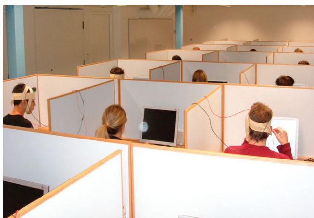
Figure 1. Experimental setting: 12 proposers and 6 responders were in the same laboratory during an experimental session. Responders received tDCS (placebo or cathodal stimulation over the right DLPFC), whereas experimenters sat between each pair of responders to control the tDCS devices.

We conducted the tDCS study with 128 subjects in the role of the proposer (no tDCS) and 64 subjects (all right-handed men) in the role of the responder who received either cathodal (i.e., excitability reducing) tDCS ( n = 30 ) or placebo tDCS ( n = 34 ) to the right DLPFC. During an experimental session (Fig. 1), 6 responders played 12 UGs each with 12 different, anonymous, proposers, that is, each responder “faced” any given proposer only once and was never informed of the bargaining partner’s identity. We deliberately chose 1-shot interactions because no strategic spillovers across periods occur with this structure. This is particularly important if “true” preferences are to be elicited. We can therefore rule out the possibility that the observed rTMS effect is due to induced ignorance of possible reputational effects. The responders had to agree on the division of 20 Swiss Francs (CHF; CHF 1 \approx € 0.65).