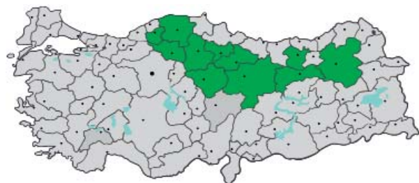
Figure 1. Provinces in Turkey where study was conducted and to which Crimean-Congo hemorrhagic fever virus is endemic (green), January–April 2009. Gray indicates other provinces and dots indicate major cities.

Of 3,557 serum samples tested, 356 (10%) were positive for IgG against CCHFV. Mean \pm SD age was 43.4 \pm 16.2 years for seronegative persons and 52 \pm 17.1 years for seropositive persons ( p < 0.001 ). Categorizing persons by