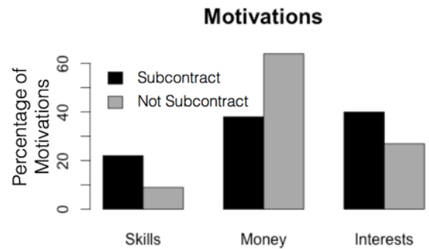
Figure 2. Overview of the motives crowd workers reported for their decisions to subcontract or not subcontract portions of the larger HIT. Sacrificing income was one of the main motives for not subcontracting.

These findings indicate that money was not the only factor in whether primary workers chose to complete subtasks