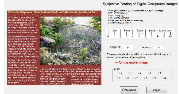
Fig. 1. Graphical user interface in the subjective test. The red tooltip will change if subjects need to judge different regions.

Subjective testing methodologies for assessing image quality have been recommended by ITU-R BT.500-13 [14], including Absolute Category Rating (ACR), double-stimulus impairment scale and paired comparison. In this study, 11-category ACR is employed. Given one image displayed on the screen, a human subject is asked to give one score (from 0 to 10: 0 is the worst, and 10 is the best) on the image quality based