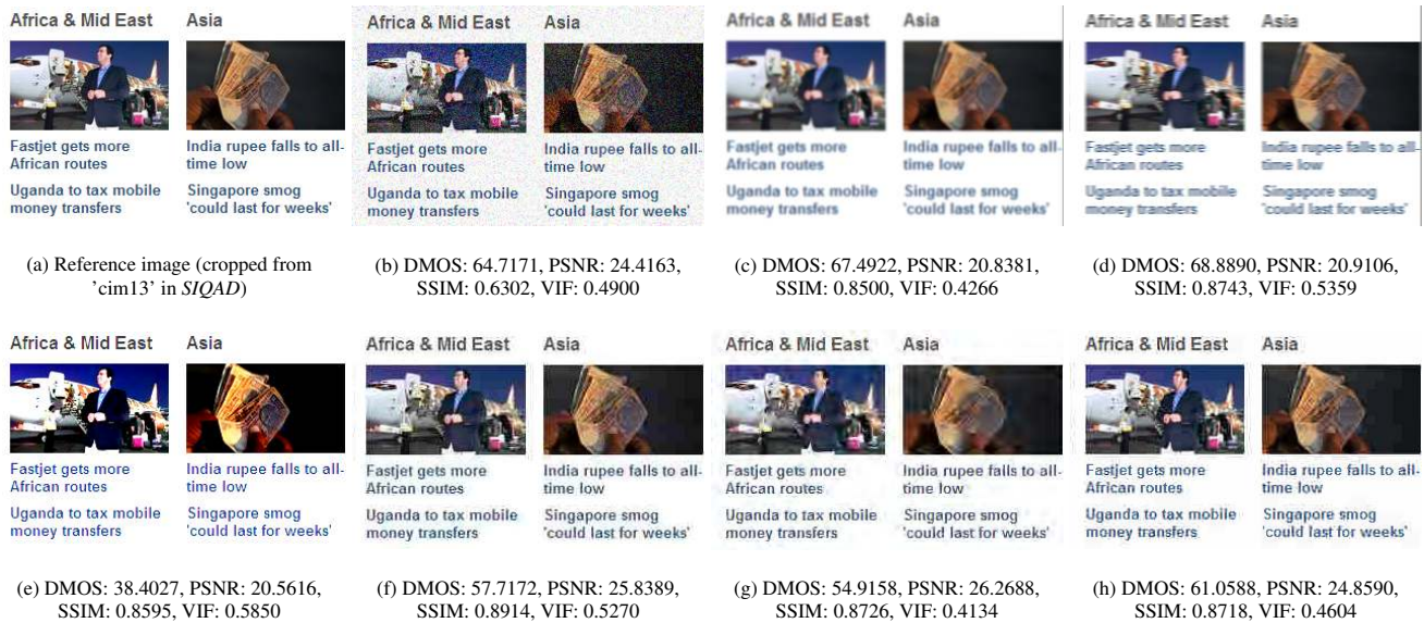
Fig. 4. Image quality comparison and quality scores computed by four different methods: DMOS, PSNR, SSIM and VIF. Images in (b)-(h) correspond to seven distortions (GN, GB, MB, CC, JPEG, JPEG2000 and LSC), respectively.

ages in H.264/MPGE-4 AVC by exploiting spatial correlation,” IEEE T-IP , vol. 19, pp. 946–957, 2010.