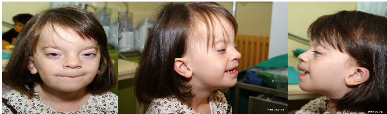
Figure 1 The facial features observed in our patient include ptosis, hypertelorism, low-set dysplastic ears and a prominent forehead.

As conventional karyotyping of the proband did not reveal any structural rearrangements, the karyotype was therefore determined to be 46, XX. Molecular karyotyping was performed on the Agilent 60K platform. Data analyses indicated a 743 kb deletion of 11q22.3 (Figure 2). An aCGH analysis of the patients' parents did not show any abnormalities; thus deletion has been determined to be de novo . Confirmation of the deletion was