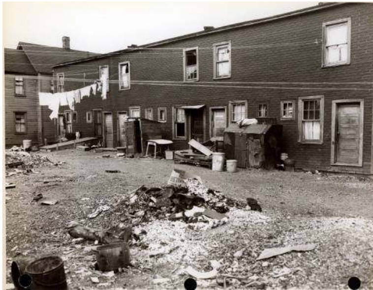
Figure 1.1. “Bennington Park.” Backyard of 132-138 E. Sunrise Highway, in the Bennington Park section of Freeport circa 1950.

suburban ‘slums’ parallel to their urban counterparts. A 1934 housing survey of the Bennington Park section in Freeport revealed that of 213 dwellings, only fifty-five were connected to the village sewer system and only forty-two had gas stoves. Storefronts were converted to makeshift housing, as Figure 1.1 shows, and residents of these ‘flats’ had to draw water from a hydrant near the privy, relying on the coal kitchen stove for heat. 62 Bennington Park’s conditions were found across the “Harlem Belts” in the incorporated villages of Nassau and western Suffolk counties, in the “Battery” section of Oyster Bay village, “the Hill” in Hempstead, “Banks Avenue” in Rockville Centre, and “Long Branch Road” in Glen Cove. In these districts, families survived without insulation or water during the winter and sewage overflowed into wells, threatening the health of those who used it. 63