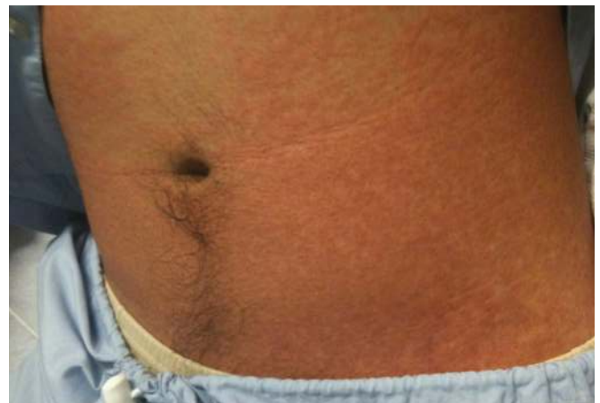
Fig. 1 Photograph shows generalised, confluent, erythematous maculopapular rash over the trunk.

A 17-year-old Chinese male adolescent presented to our emergency department with fever, myalgia and a nonpruritic maculopapular rash over his trunk and neck. He had developed nonpruritic, confluent, erythematous macules and papules after taking TMP-SMZ (80 mg TMP, 400 mg SMZ) for 28 days. The macules and papules first appeared over the neck and chest, and progressively spread to his limbs and the rest of his trunk within the next few days. He had been prescribed TMP-SMZ and isotretinoin by a general practitioner for nodular cystic acne vulgaris. Despite symptomatic treatment by the general practitioner, the patient's rash and fever did not subside, thus prompting a visit to our emergency department.