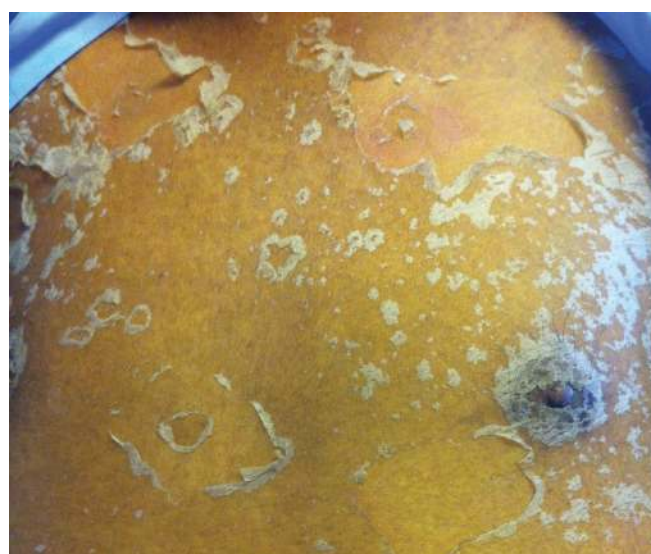
Fig. 3 Photograph shows postinflammatory hyperpigmentation with desquamation over the trunk.

Markedly raised transaminases are usually found in patients with TMP-SMZ-induced fulminant hepatic failure, with previous case reports detailing ALT and AST levels ranging from 2,000 U/L to 19,520 U/L and 957 U/L to 9,400 U/L, respectively. (4,5) Morimoto et al also reported that TMP-SMZ-induced hypersensitivity syndrome may be associated with reactivation of HHV6. (2) In our patient, polymerase chain reaction (PCR) for HHV6 DNA was negative. Recently, HEV testing has also been recommended in patients with drug-induced liver injury. (9) Although serologic testing for anti-HEV IgM with an enzyme-linked immunosorbent assay-based test (Genelabs Diagnostics, Singapore) was positive in our patient, HEV RNA by reverse transcriptase PCR and anti-HEV IgG were nonreactive. Follow-up serological tests for anti-HEV IgM and