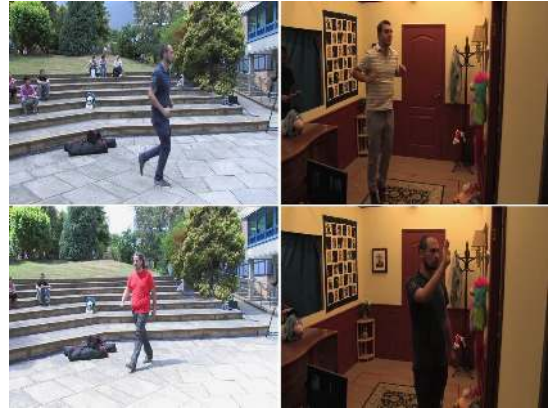
Fig. 1. Example frames from the IMPART video dataset. The respective activities are "Run" (top left), "Walk" (bottom left), "Jump" (top right) and "Hand-wave" (bottom right).

Thus each script was executed three times per actor. Three main actions were performed, namely "Walk", "Hand-wave" and "Run", while additional distractor actions were also included and jointly categorized as "Other" (e.g., "Jump Up-Down", "Jump Forward",