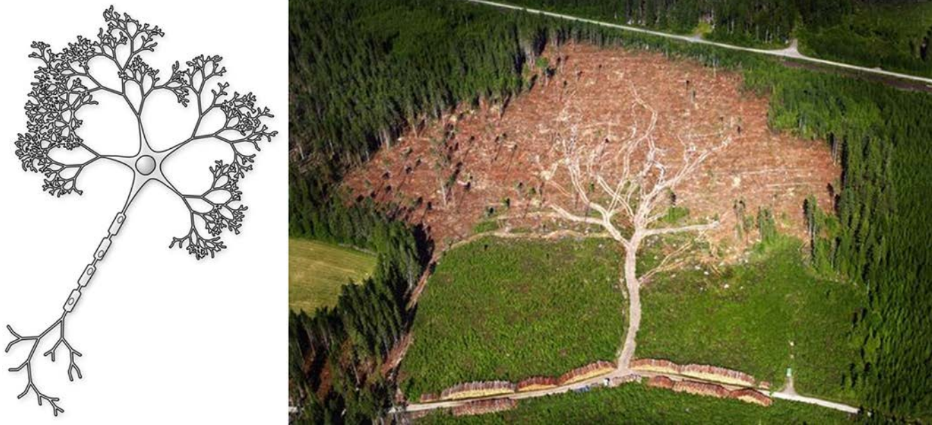
FIGURE 1 Constructal design: A brain cell and lorry tracks from clearing Woodland. [Color figure can be viewed at wileyonlinelibrary.com ]

individuals create more efficient Constructal flows in service of the Extended Mind. Put another way, a group or individual can operate within salient Constructal flows to become more intelligent. Constructal law supports common terms of analysis of both intracranial cognition, and the Extended (or organizational) Mind.