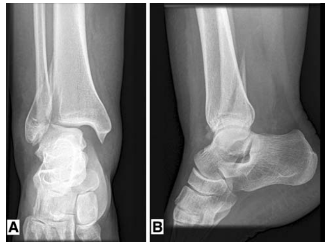
Fig. 2A–B (A) Anteroposterior and (B) lateral radiographs show an isolated distal fibula fracture with markedly increased medial joint space (between the talus and medial malleolus) indicative of failure of the deep deltoid ligament and fracture instability.

We raised several questions: (1) Does internal fixation of stable SER ankle fractures lead to reduced incidence of radiographic osteoarthritis compared with nonoperative treatment? (2) Does nonoperative treatment of unstable SER ankle fractures lead to occurrence of radiographic osteoarthritis and symptoms? (3) How common is radiographic osteoarthritis and the presence of symptoms after