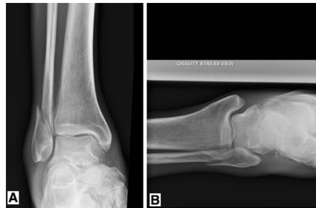
Fig. 4A–B (A) A radiograph shows an isolated lateral malleolus fracture. Is it a stable injury or not? (B) A gravity stress radiograph shows a medial clear space opening greater than 5 mm and is indicative of an unstable fracture pattern.

regarding the definition of stability and descriptions of clinical outcome evaluation methodologies were heterogeneous. These are major limitations in comparing and combining data from different publications and extrapolating their results reliably. Second, the lack of randomized, controlled trials, or high-quality prospective studies, and the heterogeneity in the design and mode of outcome presentation do not provide strong evidence regarding the outcome of SER ankle fractures. Future studies should consider reporting results according to fracture type to enhance comparability across publications. Third, although some cohort studies have reported the incidence of radiographic osteoarthritis, it is unclear whether this was related to patients’ symptoms. Fourth, length of followup in some studies probably is inadequate to assess osteoarthritis, particularly clinically evident osteoarthritis, which typically takes decades to develop. Fifth, loss to followup in trauma populations (which probably is inevitable) may underestimate complications and unfavorable results of treatment. Finally, the small sample sizes in some studies limit the validity of their findings.