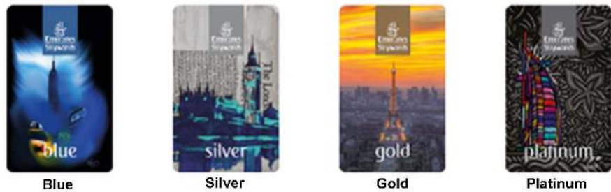
Figure 3. Rewarding membership tiers.

covering every step from conception, creation and design to delivery, implementation, management, and support. A customer is central to EAs' strength in the airline market. Customers are the ones who reflect the good or bad services of the company, whether they are fully satisfied or disappointed. EAs offer customers all they need during its operations and processes, as well as on the flights themselves, to keep customers happy.