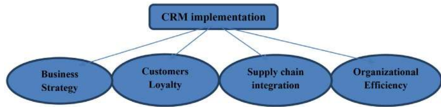
Figure 2. CRM implementation framework. Source: Authors.

airline should meet the highest quality standards, and there would be no additional capital injections from the government other than the agreed startup capital of US$10 million. Emirates was incorporated, with limited liability, by an Amiri decree issued by the ruler on 26 June 1985 and is wholly owned by the Investment Corporation of Dubai, a Government of Dubai entity. On 25 October 1985, Emirates' first flight took off and crossed the skies of the UAE. Despite the global crises, which influenced the aviation industry in the dawn of a new millennium, and strong influences from other external factors, Emirates has continued a steady annual growth rate and has never reported a loss since its renaissance in 1985 [22]. The following history highlights EA's progress: