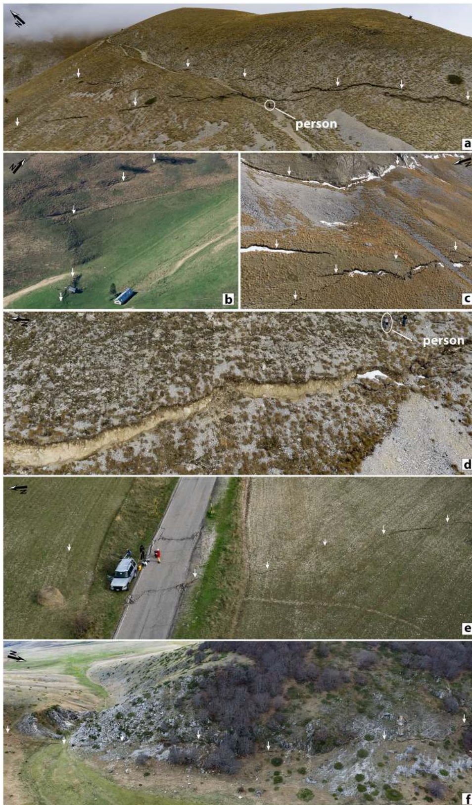
Figure 2. Examples of coseismic ruptures along the Mt. Vettore–Mt. Bove fault system as seen from helicopter surveys. White arrows mark the trace of the surface ruptures. (a) View of the continuous and stepping splay of the coseismic ruptures along the western Mt. Vettore flank (42.8083 N, 13.2630 E); (b) antithetic coseismic rupture in the middle sector of the VBFS (42.8489 N, 13.2213 E); (c) set of parallel coseismic ruptures along the western Mt. Vettore flank (42.8261 N, 13.2454 E); (d) Cordone del Vettore ruptured splay (42.8165 N, 13.2554 E); (e) coseismic ruptures along the Piano Grande di Castelluccio fault splay (42.8194 N, 13.2230 E) and (f) antithetic coseismic free-face following a cumulative fault scarp in both bedrock and alluvium (42.8531 N, 13.2119 E).