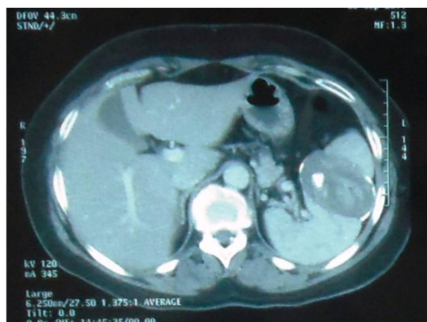
Figure 2. CT scan showing calcified hydatid cyst.