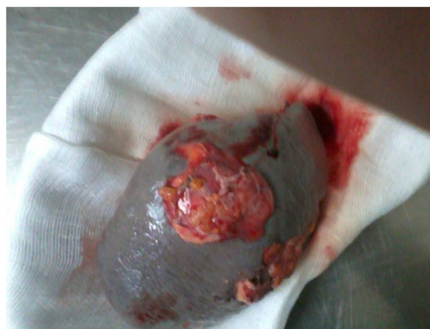
Figure 4. Per operatively view: total splenectomy for multiple hydatid cyst.

Cystic lesions of the spleen are unusual and comprise non-parasitic (pseudocysts, dermoid, epidermoid or epithelial cysts, and cystic hemangiomas or lymphangiomas) and parasitic forms. Hydatid cyst disease remains a considerable public health problem, especially in pastoral and