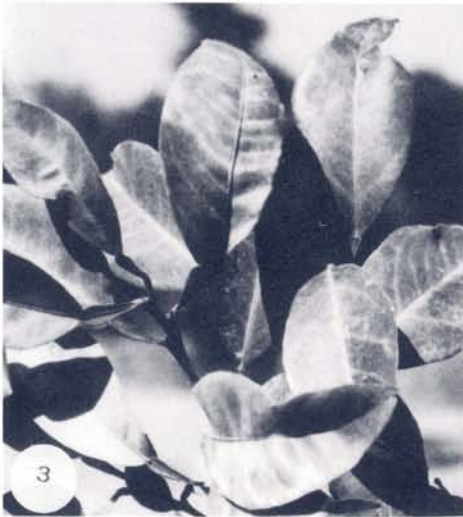
Fig. 3. Greening diseased leaves of sweet orange showing vein yellowing.

possible to demonstrate the presence of the GO in samples of Kinnow mandarin trees showing all symptoms of the disease.