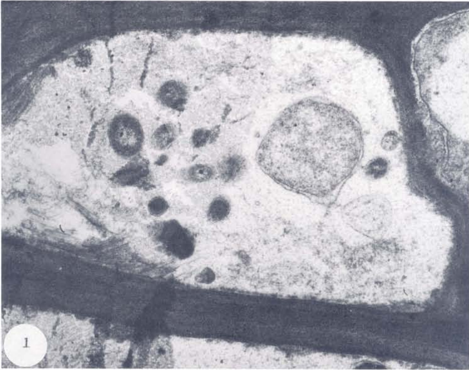
Fig. 1. Greening organism in the sieve tube of a rough lemon tree, Faisalabad (24,000X magnification).

0.1M phosphate buffer at pH 6.8 and processed in Catania for electron microscopy observations. Four grams of N-pyrrolidynomethyl tetracycline (Revering-Hoechst) dissolved in 60 ml of distilled water have been injected in April 89 in two trees of Kinnow mandarin and one of Pineapple sweet orange suspected to be infected by greening.