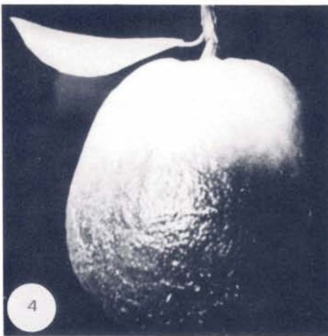
Fig. 4. Malformed and less coloured fruit of Kinnow mandarin.

During the spring survey it was noticed that citrus psylla ( Diaphorina citri Kuw.) is quite widespread throughout the province on citrus as is