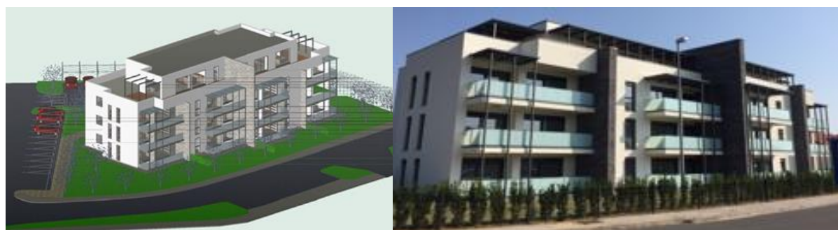
Figure 4 Modeled and completed residential block in Ljutomer [56]

Construction on the residential block in Ljutomer [55] utilized BIM to create variant 4D and 5D models relating to optional technologies for building external walls. The objective was to determine the most suitable solution for building from the perspectives of construction duration, costs, and energy savings. The outputs of the project demonstrated that such BIM models are particularly useful in preliminary project phases. The modeled and completed residential blocks in Ljutomer are presented in Figure 4.