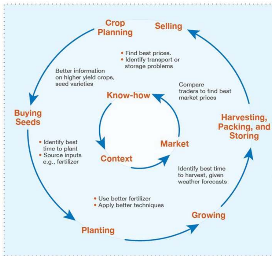
Fig 1 – Information needs of farmers (Adapted from Mittal, 2010)

Agriculture information apps can be categories or classified as follow: