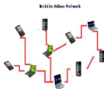
figure1 . manet

There are different criteria for classifying routing protocols for wireless ad hoc networks. For example, what routing information is exchanged; when and how the routing information is exchanged, when and how routes are computed and so on. Figure 1 show the MANET environment.