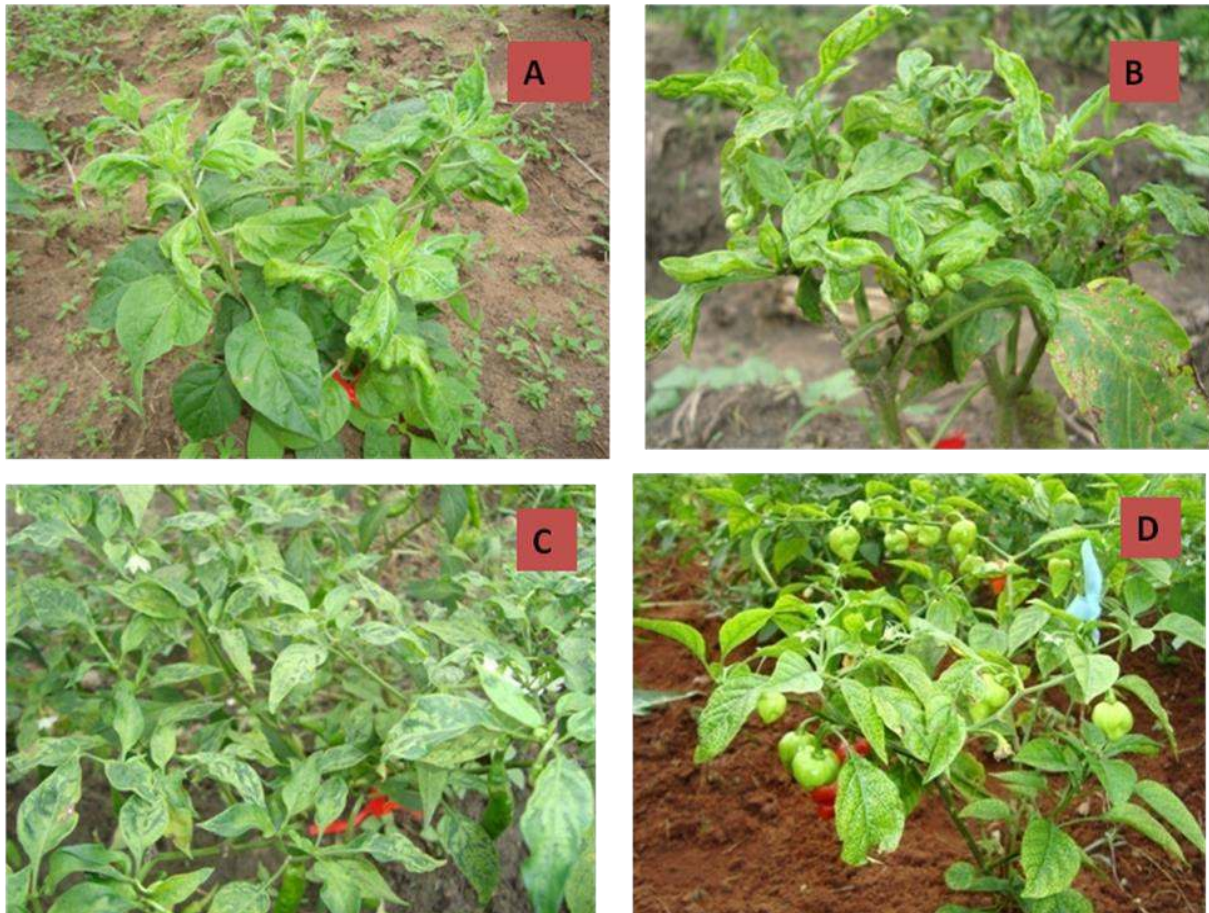
Figure 1. Viral disease symptoms observed on pepper in the farmers' fields. A= Sweet pepper plant infected with PVY, PVX, CMV and TEV; B= Hot pepper plant with CMV, PVY, PVX, TEV, PVMV, ToMV, TMV and PMMV; C= Long cayenne plant infected with PVY, PVX, PMMV, CMV and TEV; D= Hot pepper plant infected with PVY, PMMV, CMV and TEV.

and severity of infection varied significantly depending on the location. In general, the disease incidence was highest in Ekiti state (96.67%) in 2010, while Oyo had the least (66.90%) (Table 1). Ondo had the highest incidence in 2011 with 91.67%; followed by Oyo state with 80.17%, Osun had the least with 65.17% (Table 2). The south-west agro-ecological zone of Nigeria had an average disease severity score of 2.9 during the 2010 surveys and 2.8 in 2011. The disease severity was highest in Osun (average severity score of 3.1), closely followed by Ekiti (3.0). The lowest level of disease severity was recorded in Lagos state (2.6) during the 2010 surveys (Table 1). As for incidence, disease severity was highest in Ondo (3.3), followed by Oyo (2.9) during the 2011 surveys (Table 2).