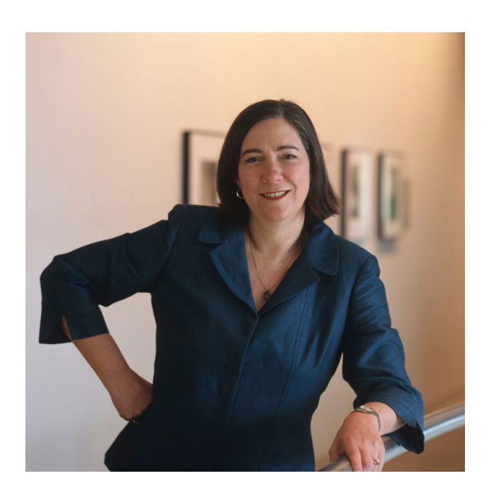
Susan Lindquist.

dogma by proposing a molecular mechanism for Hsp90 in the evolution of new traits. Like other chaperones, Hsp90 helps unstable proteins fold within the incredibly crowded environment of the cell. Uniquely, however, it has a select set of diverse, metastable "client" proteins, mostly involved in signaling and development, that require Hsp90 for normal folding and function. By nature of its activity, Hsp90 allows mutant proteins that would otherwise be unstable and degraded to fold and function in the cell. This activity allows new traits to arise and enables adaptation of populations to new environments.