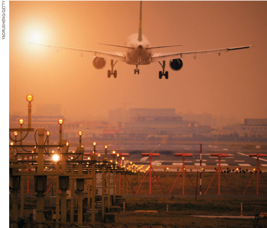
Emissions from air travel constitute a large proportion of many scientists' individual carbon footprints.

NATUREJOBS For the latest career listings and advice www.naturejobs.com