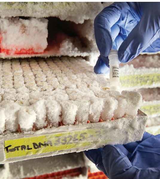
Raising freezer temperatures lowers energy use.