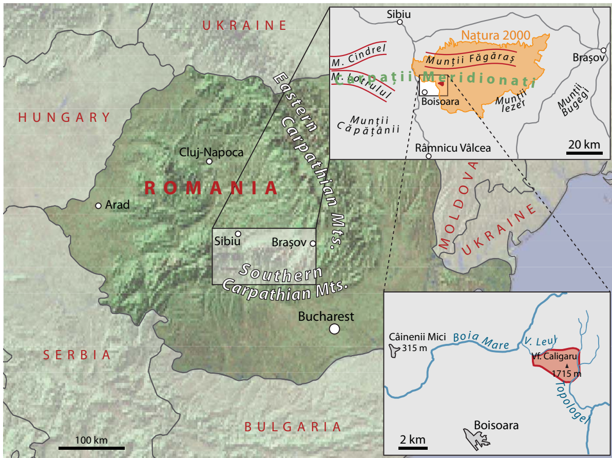
Figure 1 Geographic map of the study area: Southern Carpathian Mountains (up right) and Boisoara Forest (bottom right)