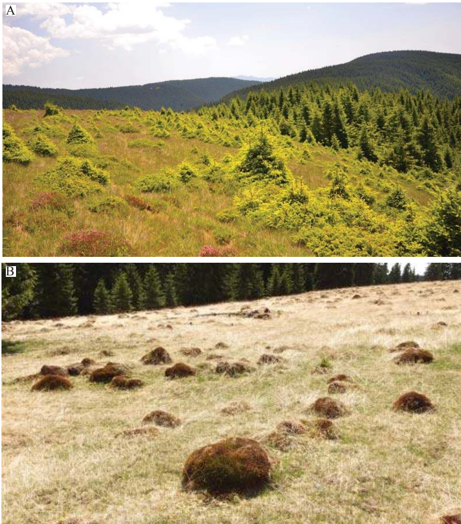
Figure 6 Habitat structures of semi-natural mountain pastures, framed by natural spruce forests

Note. A: Pygmy and heavily browsed spruces try to occupy the recent pasture land. B: Hemispherically shaped anthills protrude the surrounding grass level.