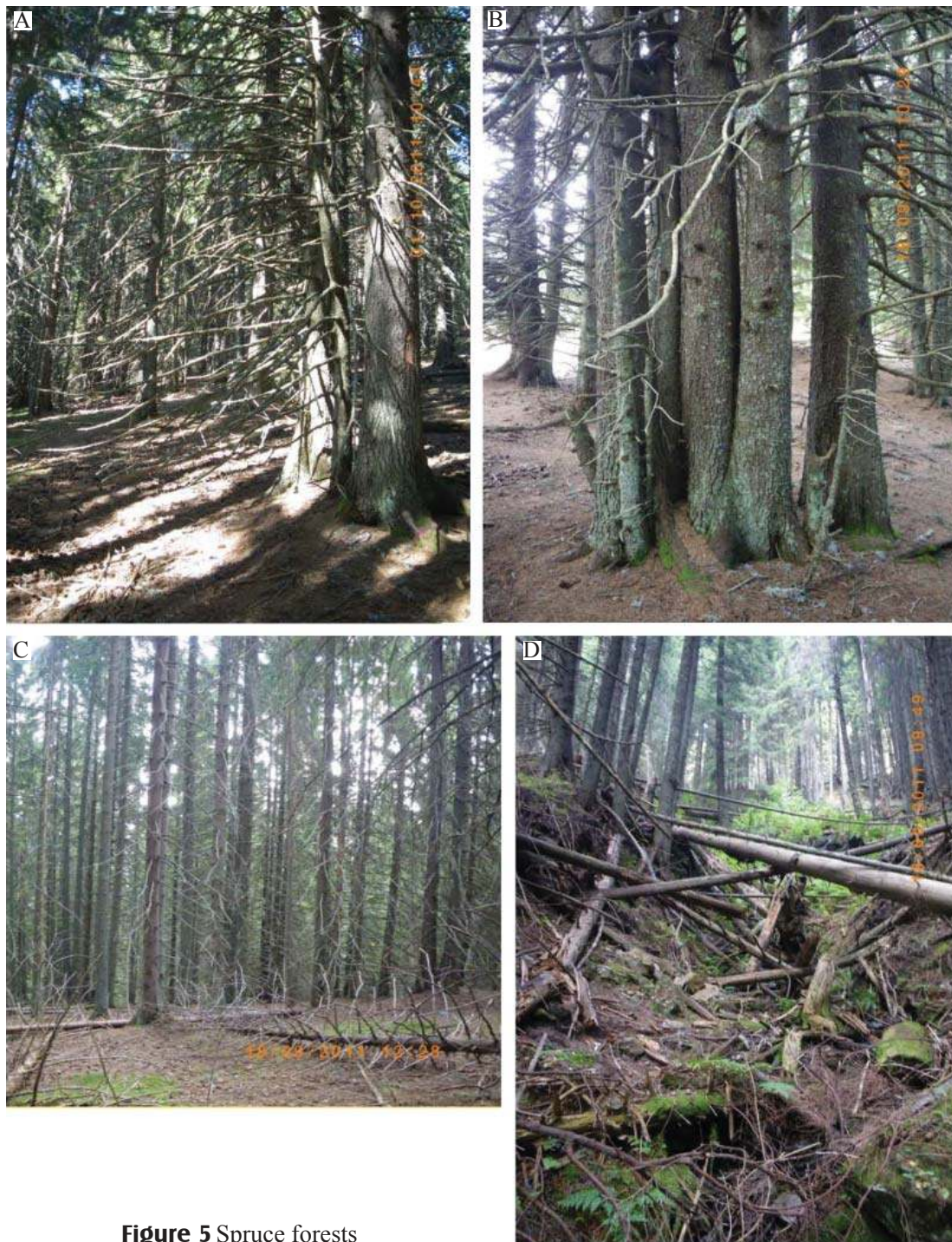
Figure 5 Spruce forests

Note. A-C: Conspicuous structures of cultivated spruce stands, resulting from secondary forests regenerating from pastures (for early successional stages, see Fig. 6A). A: Heavily branched “open grown” spruce trees (Photo: E.D. Schulze). B: Multitrunk trees, to be considered to be a cluster of individual trees, C: bare ground stage of 80 to 100 yr old stands (Photo: E.D. Schulze). D: wood accumulation in headwater streams (Photo: E.D. Schulze).