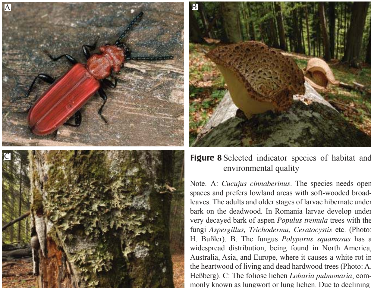
Figure 8 Selected indicator species of habitat and environmental quality

Note. A: Cucujus cinnaberinus . The species needs open spaces and prefers lowland areas with soft-wooded broadleaves. The adults and older stages of larvae hibernate under bark on the deadwood. In Romania larvae develop under very decayed bark of aspen Populus tremula trees with the fungi Aspergillus , Trichoderma , Ceratocystis etc.. B: The fungus Polyporus squamosus has a widespread distribution, being found in North America, Australia, Asia, and Europe, where it causes a white rot in the heartwood of living and dead hardwood trees. C: The foliose lichen Lobaria pulmonaria , commonly known as lungwort or lung lichen. Due to declining