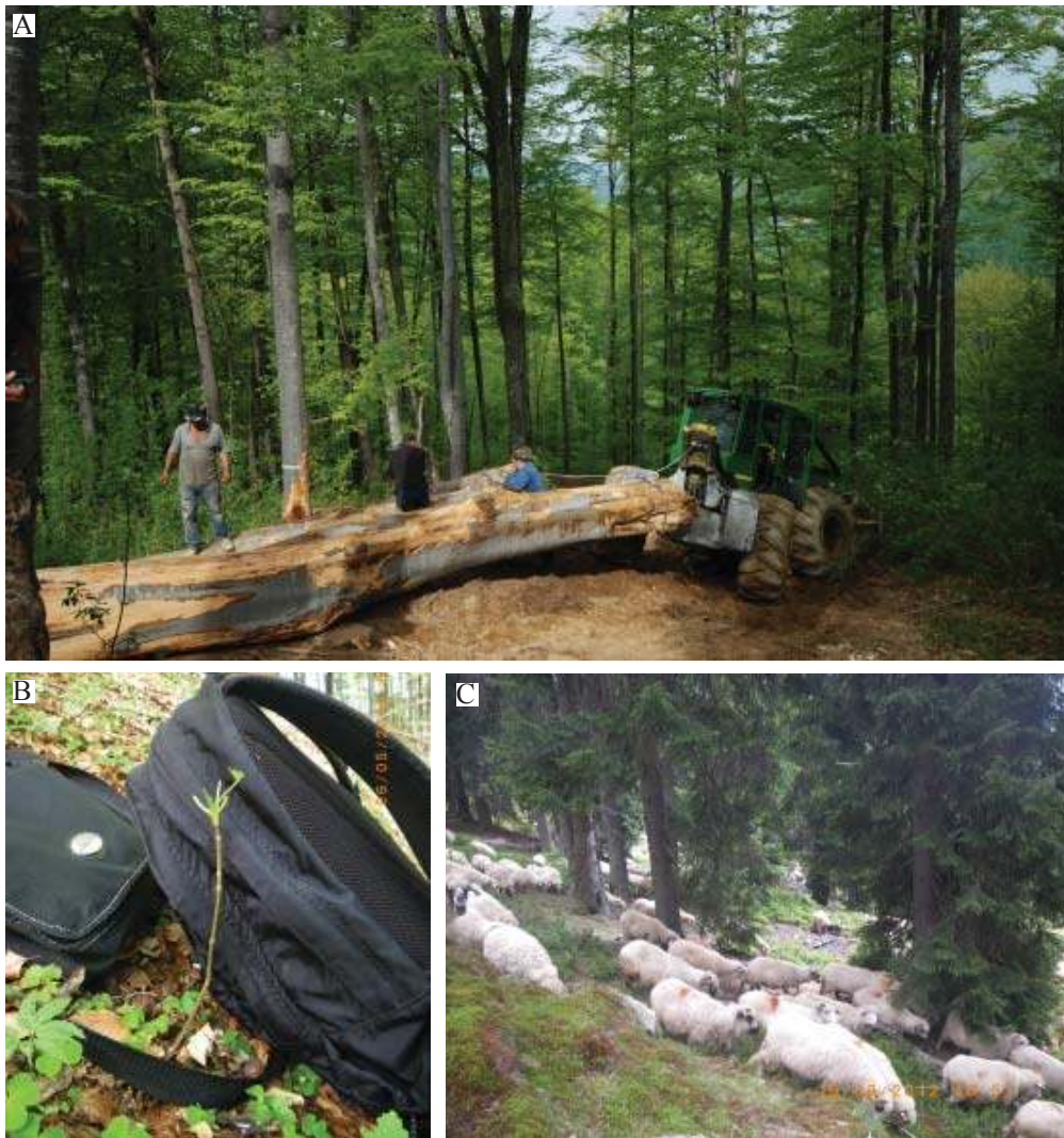
Figure 7 Anthropo-zoogenetic pressure

Note. A: Skidding damage, skidding of long wood (Photo: E.D. Schulze). B: Browsing damage to Acer pseudoplatanus (Photo: E.D. Schulze). C: Grazing of sheep in spruce forest (Photo: E.D. Schulze).