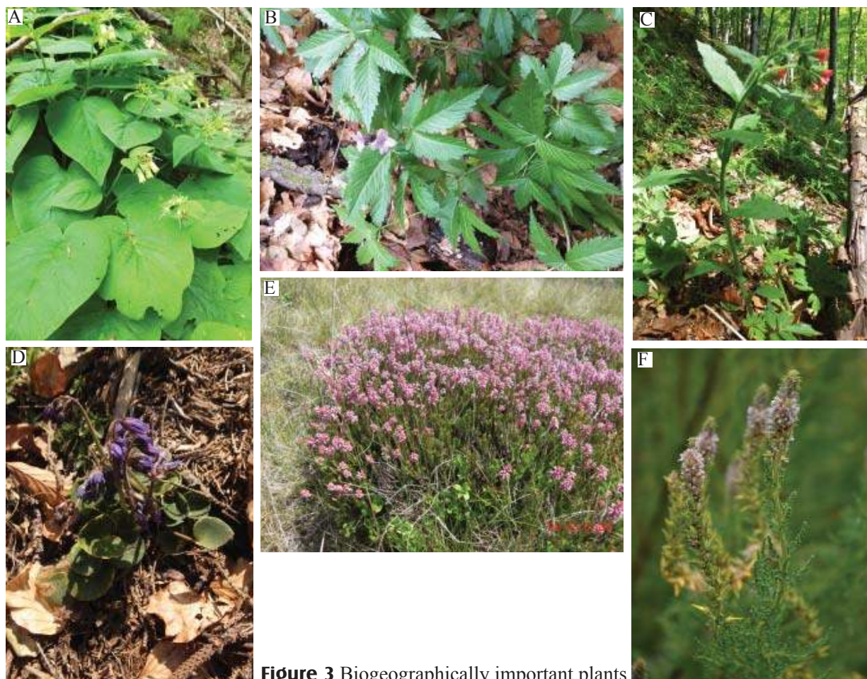
Figure 3 Biogeographically important plants

The Picea forests at higher elevation (Figure 6A; Soldanello majoris-Piceetum , Habitat Type 9410) with dominant Picea abies are characterized by Soldanella major s.l. a narrow-range species of Alpine-Carpathian distribution (Figure 3). According to Ciocârlan