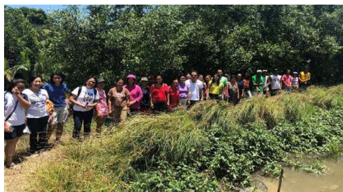
FIGURE 4. The Philippine Research Team with stakeholders at Barotac Nuevo, Iloilo.

local government unit (LGU) and a Non-Governmental Organization viz., the Zoological Society of London (ZSL); 2) Taklong Island Marine Reserve in Guimaras Province (Scheme: local community in partnership with the Department of Environment and Natural Resources, or DENR); and 3) Jalaud Mangrove Rehabilitation in Barotac Nuevo, Iloilo (Scheme: local community in partnership with the Iloilo State College of Fisheries).