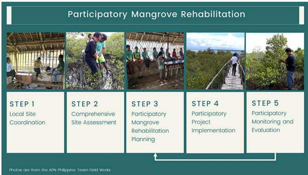
FIGURE 2. Participatory Mangrove Rehabilitation Framework.

use rights as well as management responsibilities was the key factor driving successful mangrove restoration in the Philippines and Myanmar. Furthermore, local income from non-timber forest products (in India), ecotourism (in Japan), and shrimp farming (in China) are guaranteed if healthy mangrove forests are well-kept. In all countries, the feedbacks between mangrove restoration, other land uses and non-land economic activities were considered crucial for conserving biodiversity, mitigating climate change, increasing resilience to climate change, and sustainable socioeconomic development. Poor survival rates of planted mangroves were observed to be the result of: 1) poor planning; 2) limited understanding of the site's ecology; 3) poor programme management/governance/policy concerns; 4) tenure insecurity; 5) occurrence of natural disasters; 6) poor monitoring; and (7) lack of timely corrective measures (Table 1).