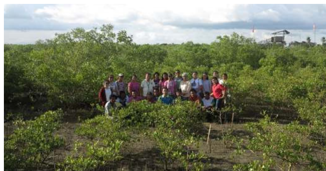
FIGURE 3. The Philippine Research Team with stakeholders at Katunggan Ecopark at Leganes, Iloilo.

In the Philippines, three case studies were completed to assess the applicability of the mangrove rehabilitation guidelines. These included: 1) Katunggan Ecopark at Leganes, Iloilo (a joint scheme of local community,