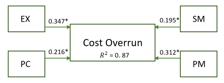
*Critical t-value: 2.58 (P<0.01)

10%, 5%, and 1% significance levels, while the t -values are higher than 1.65, 1.96, and 2.57, respectively. In particular, the percentage of model variance extraction is shown by R^2 , while path coefficients ( \beta ) indicate the strength of the relationships between the constructs [41,45]. This means that the values of path coefficients shown in Figure 3 indicate the impact of each construct on cost overrun.