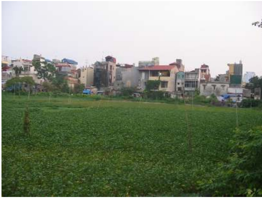
Figure 2. The freshness of urban leafy vegetables, as water convulvulus ( I. aquatica ) in ponds in inner districts of Hanoi, is one the reason of their cultivation in urban area.