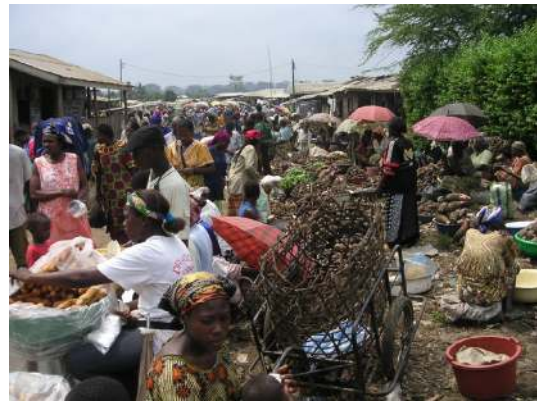
Figure 1. The informal sector accounted for more than half of the gross domestic product (GDP) of Cameroon. In agriculture industry, it includes agricultural production activities as well as marketing of agricultural products as in Muea next to Douala.

Urban agriculture is one of the traditional activities conducted by African households as a risk-sharing strategy, but also as a significant part of their culture and tradition of urban gardening. As stated by Page (2002) in the case of Cameroon: “Far from being a technical practice, urban agriculture has often been a culturally and politically important aspect of urbanism in Africa”. Urban growth and the consecutive structural changes in landscape and livelihoods affect urban agriculture. In Africa, the institutional interactions between the ministries of Agriculture and the ministries of Urban Planning often turn