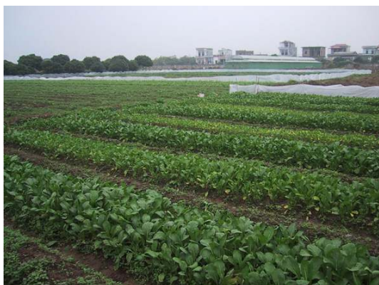
Figure 4. The cultivation of short-cycles leafy vegetables, from 25 to 40 days, as choysum ( Brassica rapa cvg. Choysum ) in Hanoi, is one of the main characteristics of the urban and peri-urban production.

agriculture. These include the forum in Harare in 2003 attended by local governments from Kenya, Malawi, Swaziland, Tanzania and Zimbabwe, and the Quito declaration signed in 2000 by city mayors from 22 countries in Latin America and the Caribbean (Veenhuizen, 2006).