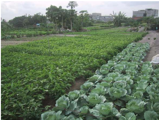
Figure 3. Amaranthus and cabbages are two worldwide leafy vegetables grown in tropical urban and periurban areas, mainly in developing countries due to the high adaptation of some varieties to high temperature and humidity.

refrigerators. These leafy vegetables are mostly brought into town from distances of less than 30 kilometers from the city centers, be it in Africa or in Asia. The urban agriculture origin represents more than 70% of the contributions in all the cities investigated. In Hanoi in 2002, more than 70% of all leafy vegetables came from a production radius of 30 kilometers around the city. Ninety-five to 100% of all lettuce came from less than 20 kilometers away, while 73% to 100% of water convulvulus was harvested less than 10 kilometers from the city (Moustier et al., 2004). In Phnom Penh, urban areas, i.e., those located inside the municipality, supply all of the water convulvulus marketed in the city. This is a vegetable particularly important for consumption by the poor (Sokhen et al., 2004).