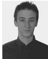
machine learning and pattern recognition with applications in biomedical engineering.