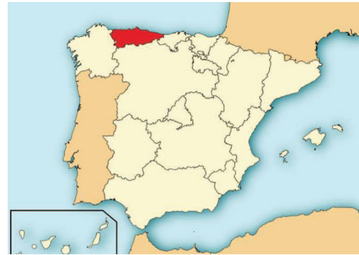
Fig. 6. Asturias within Spain.

Once we have checked that the ILP model might fail in calculating a solution on medium-large areas of interest, we here report on the experiments performed over one small geographical area (comparable with Cádiz) independent of the other three, so we guarantee that the ILP model can find the optimal solution in a reasonable amount of time, allowing us to therefore test the goodness of the solutions obtained by the heuristic. The chosen area