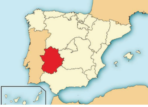
Fig. 3. Extremadura within Spain.