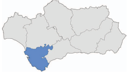
Fig. 5. Cádiz within Andalucía.

We therefore have 3 \times 4 = 12 possible scenarios. Over each scenario, we solved the corresponding problem by means of the ILP problem, and the heuristic for values of \ell = 1, 3, 5, 9, 13 . Note that, the heuristic with \ell = 1 coincides with the classic greedy algorithm. The results obtained are presented in Table I. The meaning of the headings in the table is: