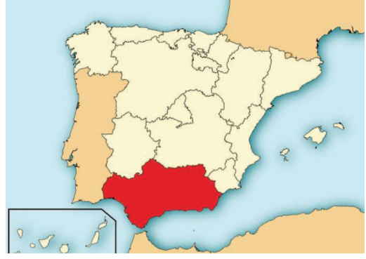
Fig. 4. Andalucía within Spain.