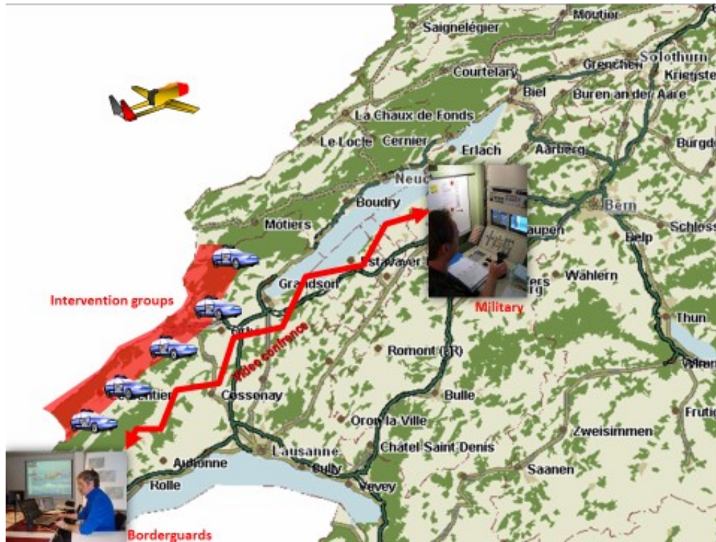
Figure 1. Visual representation of the location of the actors Plan drafted by the border guards, amended by Silvana Pedrozo (2016a).

contemporary society in order to monitor its subjects and objects is becoming commonplace and plays a role in the use of ever more efficient technologies in the hope of maximising data acquisition. The Swiss border guards understand this, which is why they have been using drone systems in the Swiss border space for more than 15 years. Their purpose is simple: