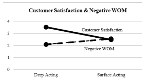
Figure 4. Emotional Labor Strategy on

Figure 4 demonstrate the experimental study which found the significant difference of emotional labor strategy between surface acting group and deep acting group on negative WOM, t(60) = -3.12, p < 0.05 (2-tailed), 95% CI [-0.80 - 0.17]. T-test proved that participants in deep acting group performed less negative WOM ( M_{\text{deep-acting}} = 2.10, SD = 0.63 ), compared with surface acting group ( M_{\text{surface-acting}} = 2.59, SD = 0.58 ). This result supported the hypothesis 2.