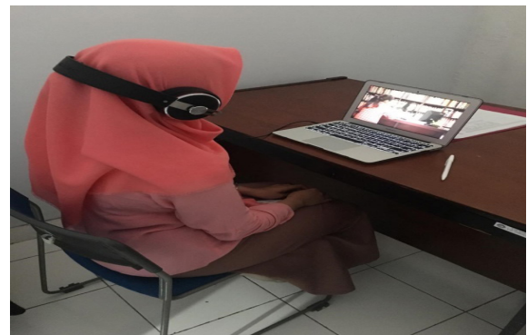
Figure 3. Experiment Process

Figure 3 show that after watching the video, participants were asked to complete the customer satisfaction scale, negative WOM scale, and manipulation check form. The experimenter ensured that all scales have been filled, then closed the experiment and said thanks to all participants.