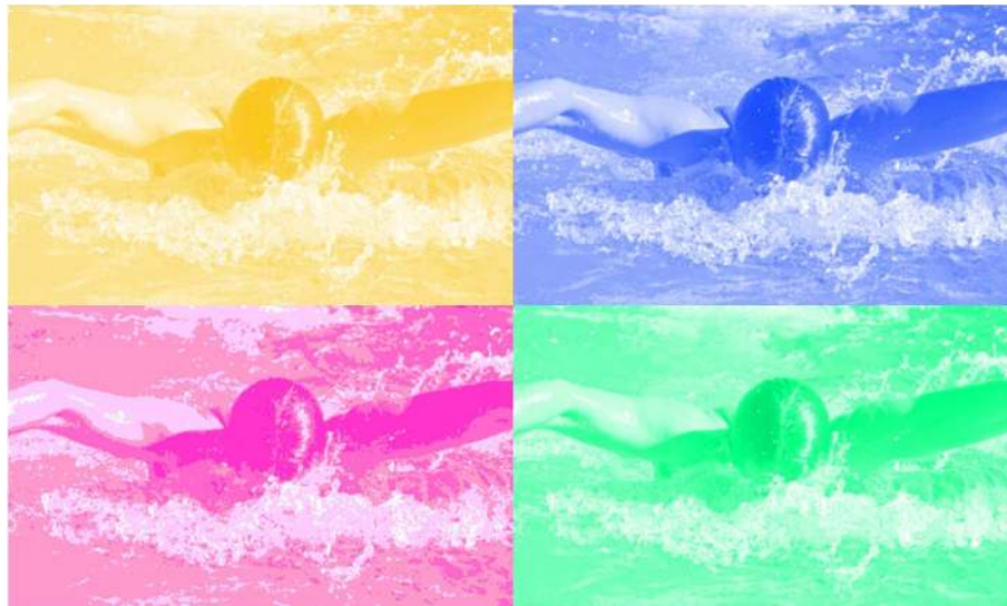
FIGURE 2 | Stimuli used in the Stroop test: Example pictures of a person swimming butterfly stroke, painted either in a subject's synesthetic color (congruent) or in one of his non-synesthetic colors (incongruent). Reprint from Nikolić et al. (2011).

Not only subjects' reports were taken into account, but also two standard tests for synesthesia, the consistency test, and the Stroop task, provided objective evidence for the existence of swimming style-color synesthesia (see Baron-Cohen et al., 1987; Odgaard et al., 1999; Mroczo et al., 2009). Swimming style-color synesthetes reported significantly more consistent colors than control non-synesthetes trained in these associations. Furthermore, in a Stroop task the color naming times accelerated when the color of the colored photograph was congruent with the synesthetic color of the presented swimming style and slowed down when the color was incongruent ( Figure 2 ).