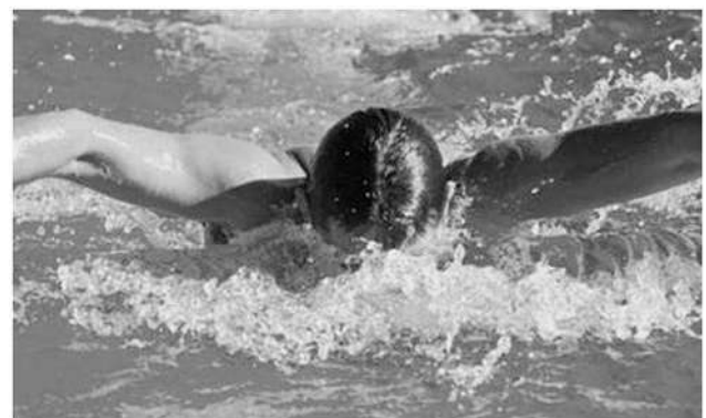
FIGURE 1 | An example photograph shown subjects in the study of Nikolić et al. (2011).

A novel form of synesthesia, swimming style-color synesthesia, has been discovered in two known grapheme-color synesthetes, who are semi-professional swimmers. The visual experience or imagination of four different swimming styles (breaststroke, butterfly, crawl, and backstroke) is synesthetically associated by them with four different colors (Nikolić et al., 2011). The induction of this kind of synesthesia took place exclusively under laboratory conditions and did not require any measurements in a swimming pool. All what subjects had to do was to take a look at photographs of other people swimming (e.g., Figure 1 ) or to think about/mentally visualize a given swimming style. This was sufficient to elicit their color experience.