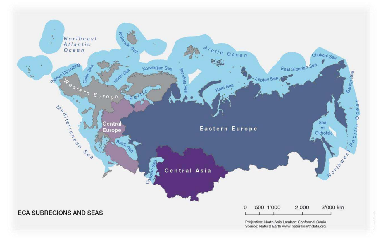
Figure A1.1: The four sub-regions of the IPBES Europe and Central Asia Regional Assessment.

Europe and Central Asia encompasses four sub-regions (see Figure A1.1) and 54 countries (see Table A1.1). According to Rounsevell et al. (2018) these countries vary greatly in size, including the largest and smallest on Earth, have diverse geography and history, but also common properties in terms of geography and climate, history and social systems. The region shares many cultural norms and historical features reflected in some similarities in land use, environmental history, biodiversity and ecosystem services. Nevertheless, the region encompasses high heterogeneity in natural and socio-cultural aspects. The seas that surround the region are also very heterogeneous in terms of temperatures, currents, nutrient availability, depths and mixing regimes.