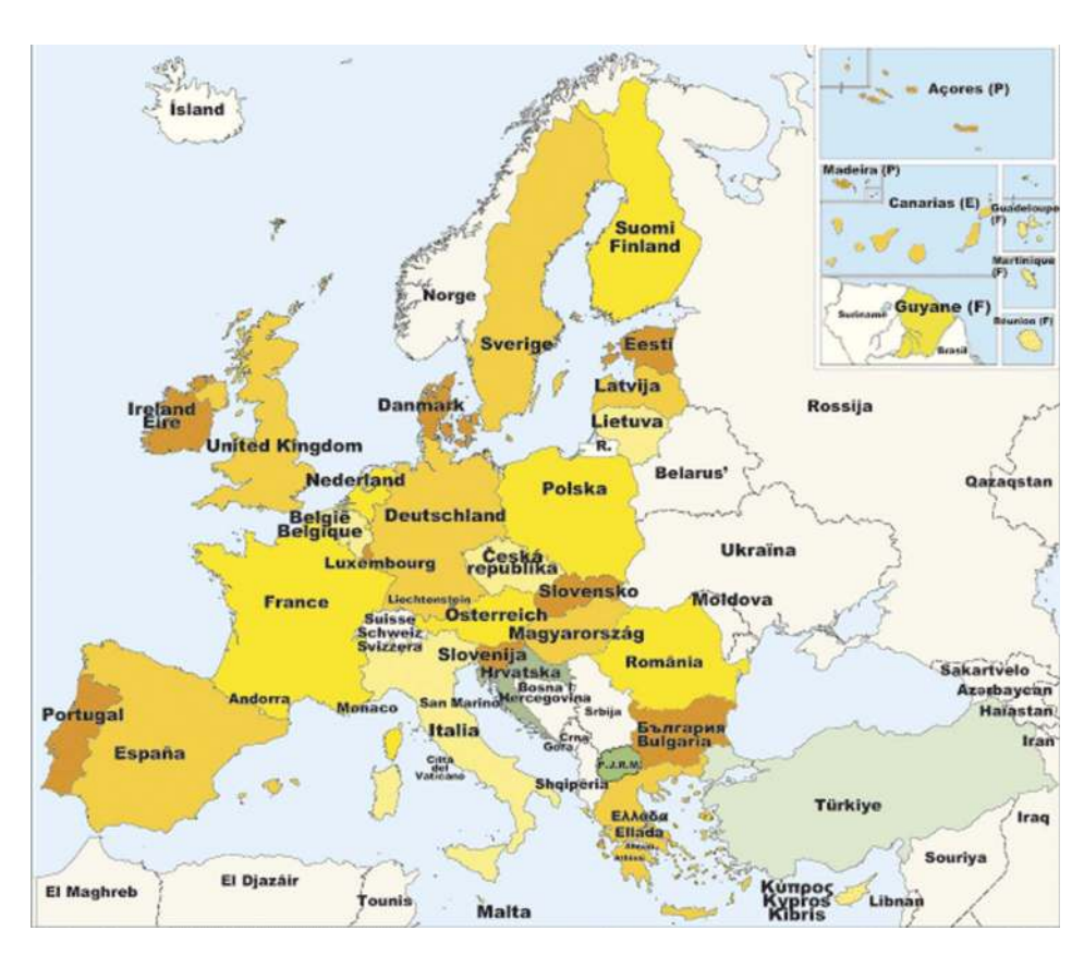
FIGURE 2 United in Diversity – the individualistic style. Retrieved from http://europa.eu/abc/maps/index_en.htm, accessed 23 April 2012 (color figure available online).

through local place-names (rendered in the Latin alphabet) and different saturations of colour for the component provinces, while unity is expressed through contrast against the cartographically featureless, uninviting 'blandmass' surrounding the empire. In this way, both the Holy Roman Empire and Imperium Europaeum are prominently displayed in a way that acknowledges the individuality of members but still categorises them as components of a larger supra-polity; maps which fully display polities which are united in their own diversity.