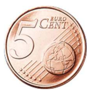
FIGURE 8 Common face of 5c, 2c and 1c coins, post-2000. Figures 7, 8, and 9 retrieved from http://www.ecb.int/euro/coins/common/html/index.en.html, accessed 23 April 2012 (color figure available online).

Significantly, each of these styles corresponds closely to the three categories of imperial map. The €2 coin at the left of Figure 6 displays a clear universalistic style of map, a cartographic portrayal of a homogenous Europe defined by exclusion of the outside. Figure 7 displays an individualistic map, portraying a disjointed Union formed of multiple individual states. The third cartographic portrayal, Figure 8, is the only one which can be justifiably