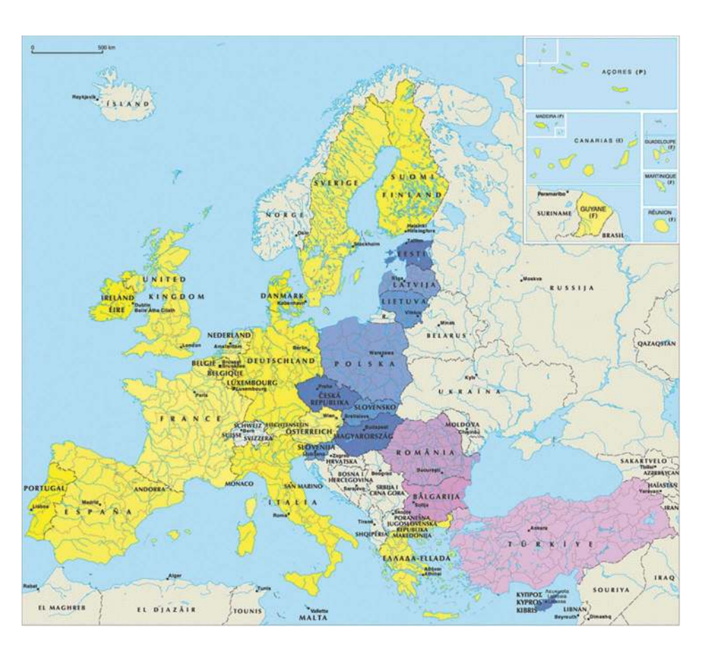
FIGURE 4 Mapping Manifest Destiny – the expansionistic style. (color figure available online).

Here, a single hue is used not only to clearly define a collective Union against a drab, undifferentiated 'Other' beyond the frontier, but is also used to depict imperial expansion. In older member-states of the Union, a heavy saturation of colour is used to denote founding states while different hues are used to depict newcomers. It is curious to note that Turkey, which remains a non-member, is depicted in the same colour as states which have now