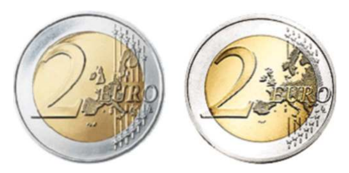
FIGURE 6 Contrasting images: pre-2004 (left) and post-2007 (right) Euros; common face (€2 and €1 coins) (color figure available online).