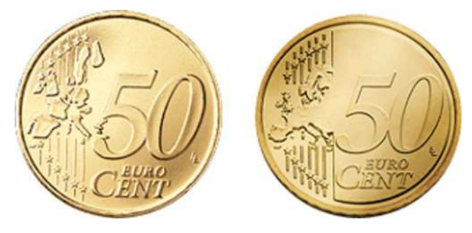
FIGURE 7 Pre-2004 (left) and post-2007 (right) Euros; common face (50c, 20c, and 10c coins) (color figure available online).