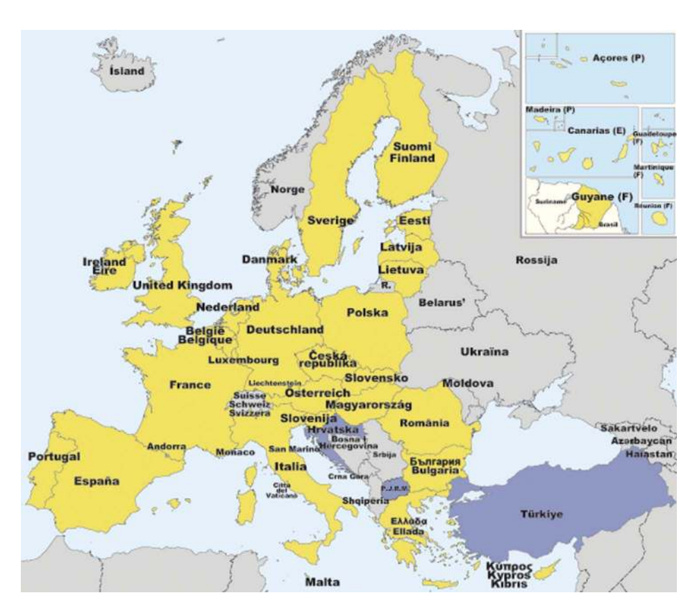
FIGURE 3 Europa Universalis – the universalistic style. (color figure available online).

different colour continues. Here though, prospective members do not form a march . The imperial frontier is very clearly marked in colour; a bright, psychologically stimulating colour for the Union and a drab, unappealing hue for a non-Europe apparently too uninteresting and unworthy of mention to even warrant those place names visible in the individualistic map. Internal individuality is minimised, prospective members are again given a mere acknowledgement, and those areas which are neither part of the Union nor desired by it are pushed further into the cartographic background. The emphasis of this category of map is overwhelmingly a focus on territory, and the implied power of the polity governing it.