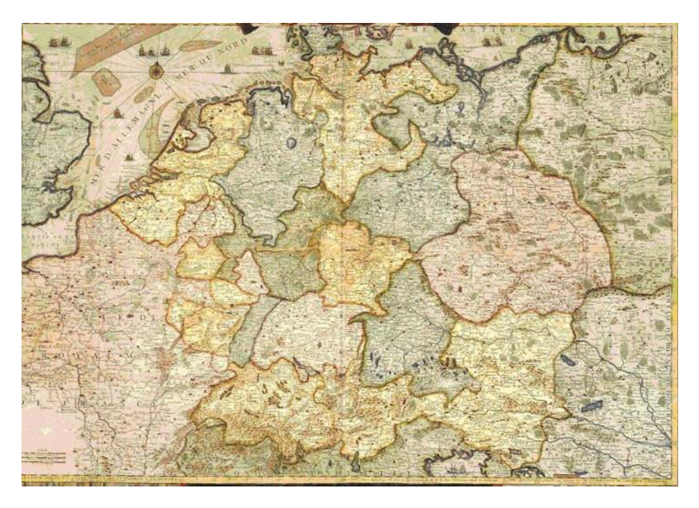
FIGURE 1 Imperium Romanum Sacrum , c. 1760. Retrieved from http://www.almanachdeholyromanempire.org/, accessed 23 April 2012 (color figure available online).

The similarities between the two may not be particularly striking at first glance, but nevertheless they exist. Both maps juxtapose an imperial polity formed from multiple member states whose individuality is emphasised