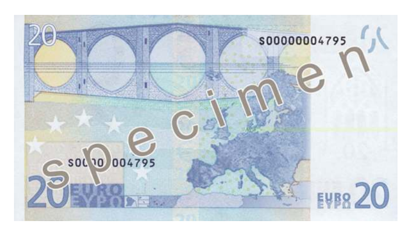
FIGURE 9 Reverse face of Euro banknote (all notes). Retrieved from http://www.ecb.int/euro/banknotes/html/index.en.html, accessed 23 April 2012 (color figure available online).

as it seeks to expand into all areas of the European landmass – and expresses this desire through cartography. In these maps, the polity of Europe and the landmass of Europe become inextricably linked, reinforcing in the viewer's mind that the EU is Europe and that Europe is the EU. Ultimately, maps of the Union depict not the physical toposphere of Earth nor even the anthroposphere; the realm of human activities overlapping the planetary crust. Instead they map the noösphere – the realm of the human mind as conveyed in territorial terms. The link between territory and polity could not be more explicitly expressed than here, through the EU's own cartographic icons.