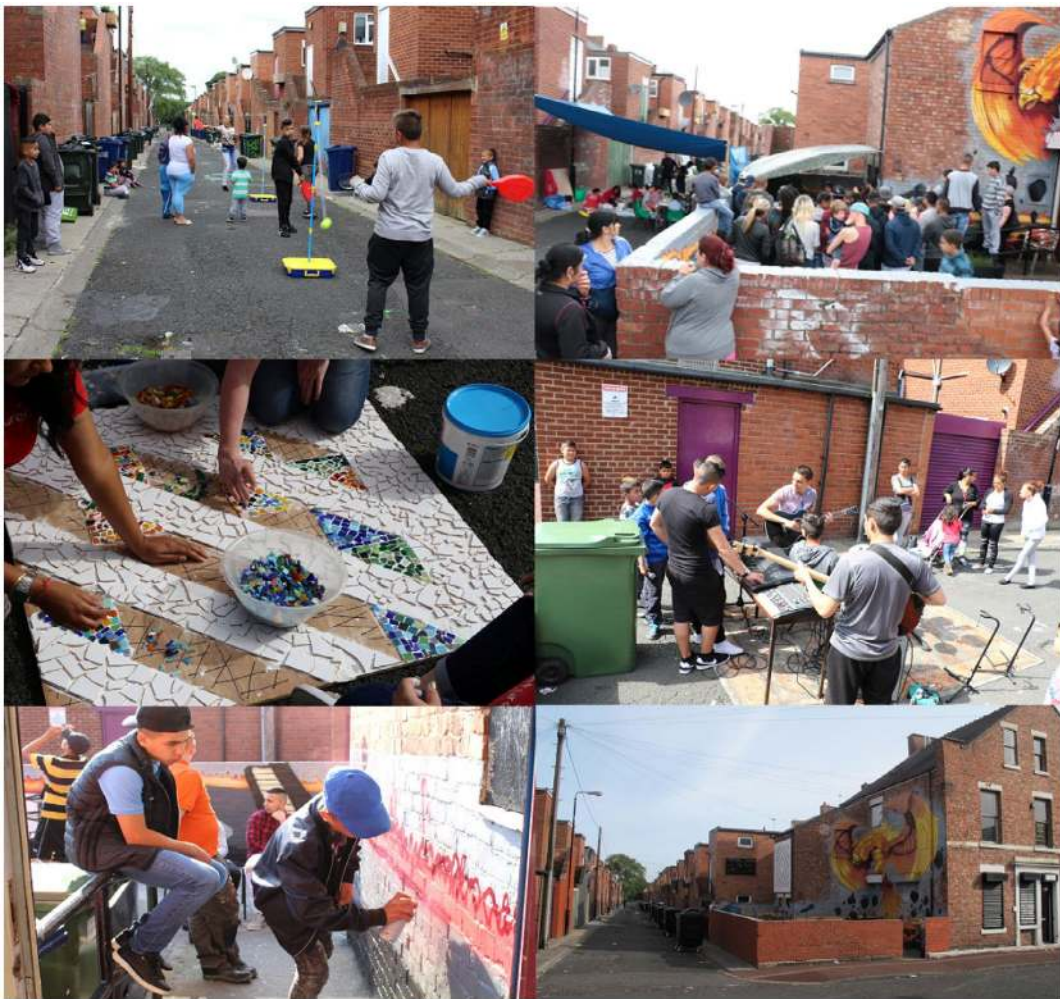
Figure 3. Activities and street improvements undertaken as part of 'Reclaim the Lanes'.

in-depth conversations with Slovakian-speaking residents about where they were from, where they were living now and about their views on waste collection and street cleaning systems.