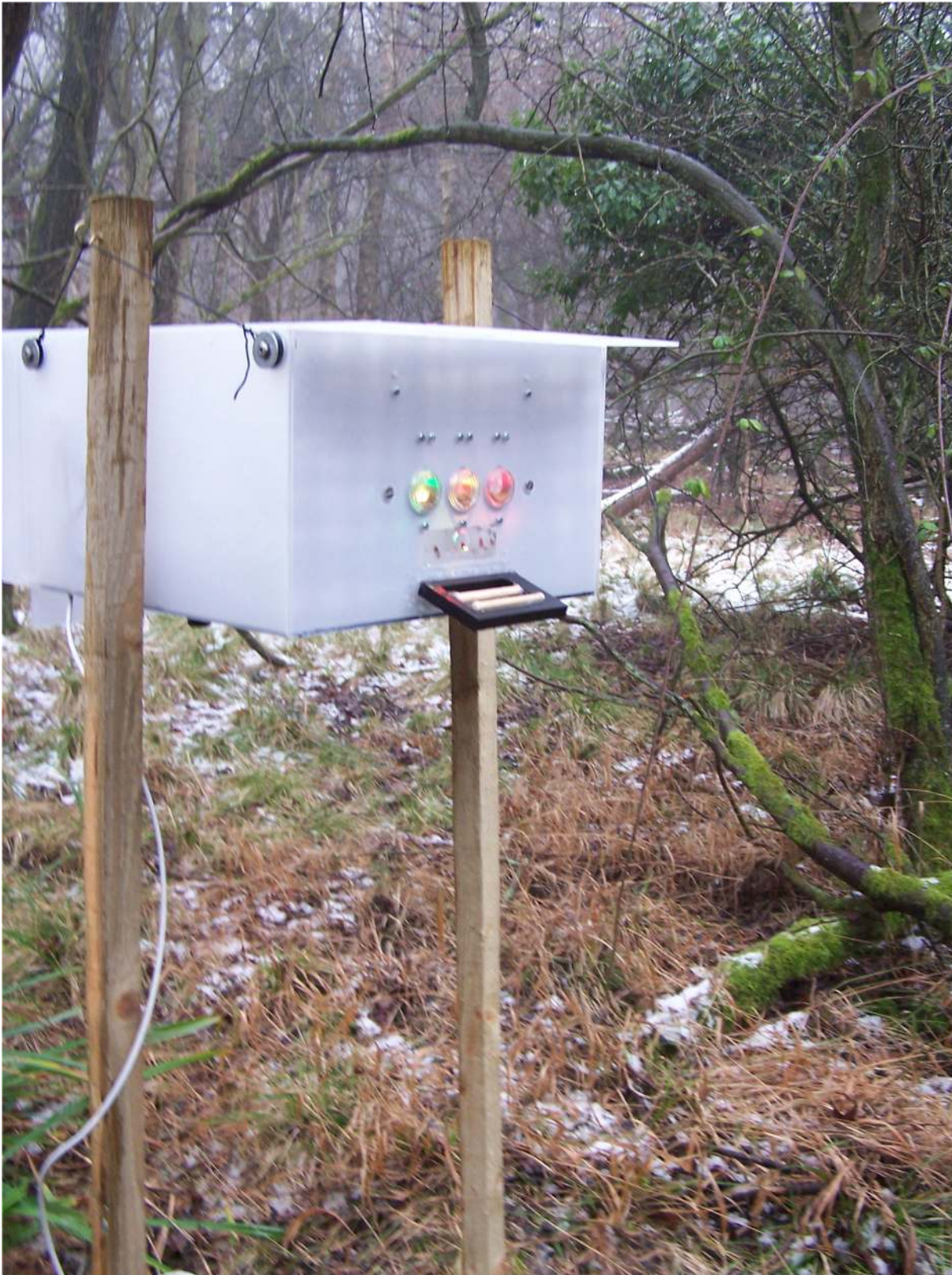
Fig 1. One of the portable operant devices installed in Wytham Woods, Oxford, UK. The weatherproof external casing is made of opaque Perspex, while the three response keys and the section of the front panel comprising the feeding hole are transparent. The perch (bottom of the front panel) is equipped with an antenna that relays information about the unique PIT-tag combination of marked individuals to the printed circuit board located within the device.