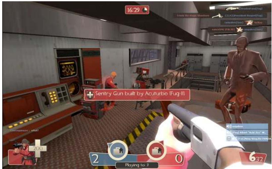
Figure 2: Video screen capture of game play [20]

Thus, the data set being examined consisted of two simultaneously-recorded, overlapping video files, each of which captured a different set of details about the game play being studied. One video file shows the player and his computer, while the other shows just the computer display in much greater detail. The two video files have totally separate audio tracks, with one file including all sounds made by the observed player and the researcher, and the other file including all sounds produced by the game and all in-game chat contributions made by all players except the observed player. The game environment was too complex for either method to capture all the important data; it is only through examining both media streams that we get a full picture of this player's in-game experience. [21]