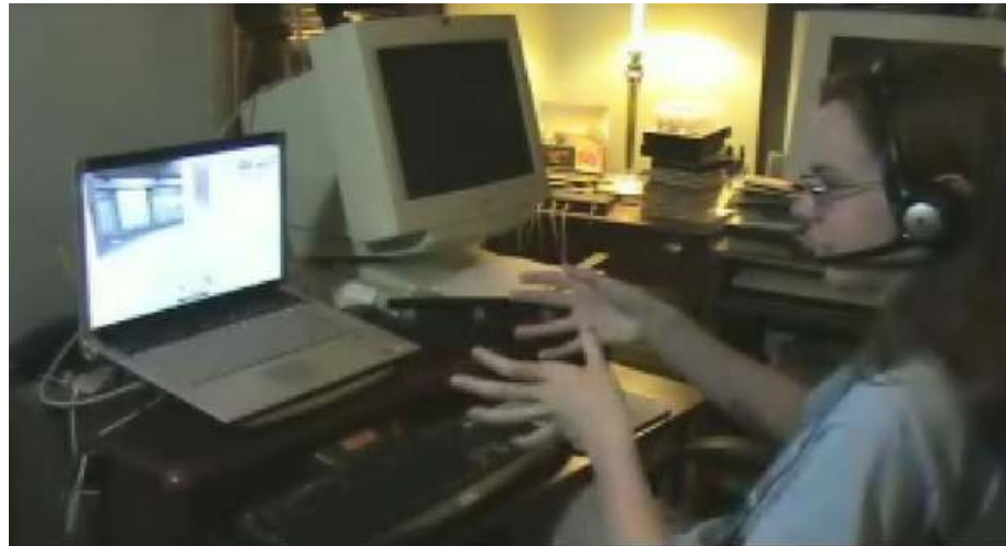
Figure 1: Video capture of the subject playing the game [18]

The audio track for this video consisted of all sounds made by the observed player, both in-game chat directed (through his headset microphone) at other game players and talk-aloud commentary directed at the researcher. The subject and the researcher interacted during some of the game play, with the researcher asking occasional questions about the game context and the play decisions the player was making. No audio from the game itself or chat from other game players within the game's chat channel was captured by the camera, as the observed player was wearing headphones rather than having game sound come through his computer speakers. [19]