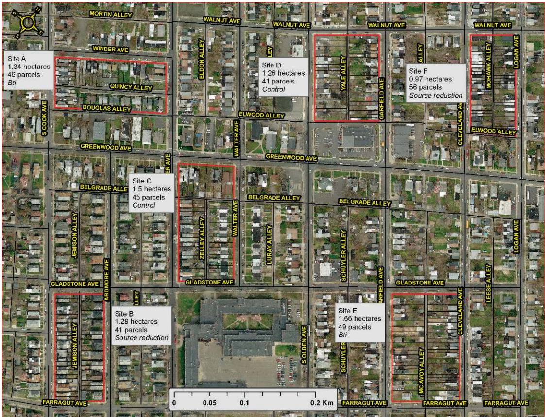
Fig. 1. Aerial photograph of field site subplots and parcels in Trenton, New Jersey. Subplots A and E were treated with Bacillus thuringiensis var israelensis ; subplots B and F received source reduction; subplots C and D were the control groups.

large area in a short time. Backpack sprayers have been used internationally to control dengue vectors, both indoors and outdoors in suburban residential areas and temporary settlement sites in Malaysia (Lee et al. 2008), and for control of Ae. albopictus in natural habitats in Singapore (Lam et al. 2010).