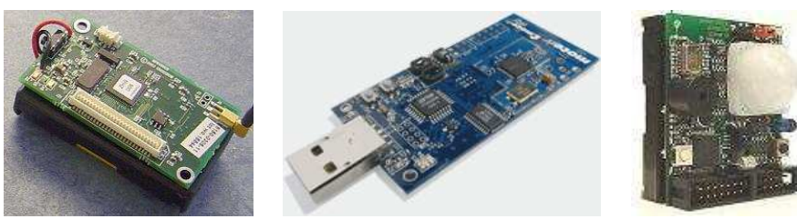
Fig. 2. Current sensor node hardware: Mica 2 by Crossbow, Berkeley (from [Mar04]); Tmote sky by moteiv, Berkeley (from [motb]); and Embedded Sensor Board by ScatterWeb, Berlin (from [Ber])

A JTAG interface is available as an alternative programming method and can also be used for debugging.